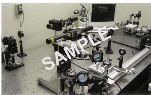
Fig. 2 Captions with two or more lines should be left-aligned below the figure. Add one-line spaces above and below the figure caption.